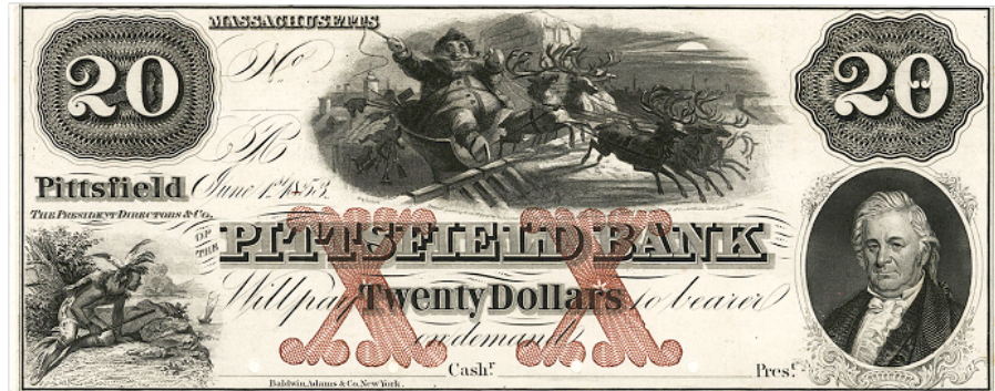
$20 private bank note, 1850s

Other notes feature unique design elements as well. The Santa Claus note shown here is whimsical and entertaining and very much in demand by collectors. The Santa Claus design suggests happiness and generosity — characteristics not often associated with banks.