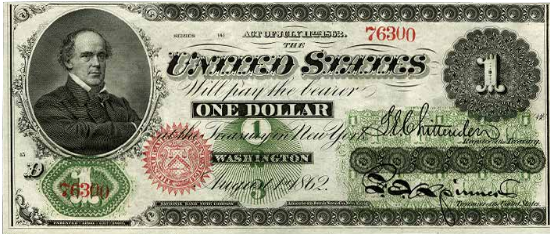
$1 legal tender note, issued in 1862

On the front of today's $1 note, you see the modern U.S. Treasury seal (shown at right). The balancing scales represent justice. In the center of the seal, the chevron's 13 stars represent the 13 original colonies. The key underneath is an emblem of official authority. According to the Treasury Department, the original seal, which was very similar to the one shown here, was designed by Francis Hopkinson, a delegate to the Continental Congress. The present, more streamlined design was approved in January 1968.