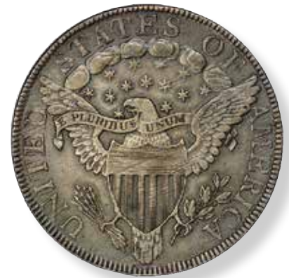
Silver coin, circa 1801-1807