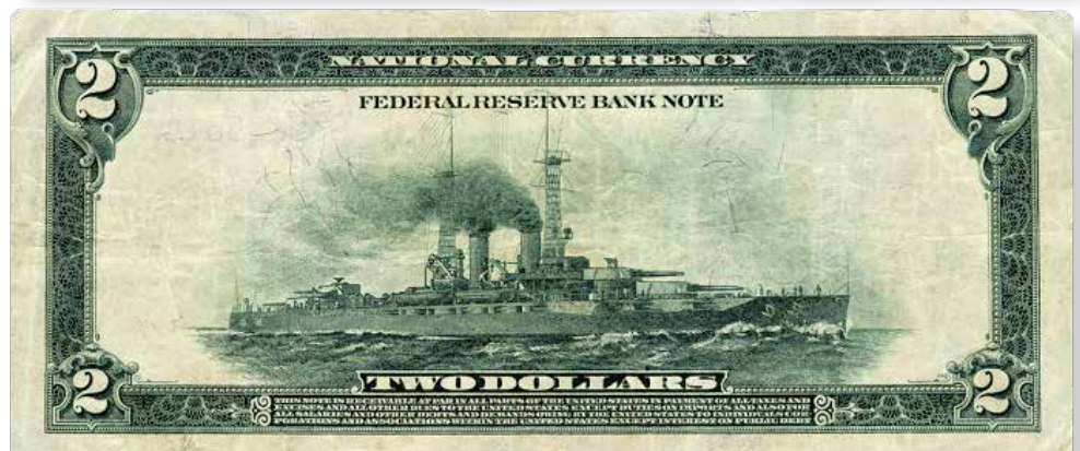
$1 and $2 Federal Reserve bank notes, series 1918