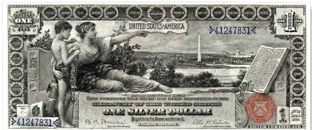
$1 silver certificate, series 1896

Sometimes the symbolism employed on a bank note can provoke a strong reaction from the public. That was the case with at least one of the notes in the U.S. Educational series of 1896. The $1 silver certificate in