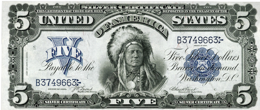
$5 silver certificate, 1899

note is an allegorical female representing electricity as the most dominant force in the world. While classical female figures appeared on hundreds of different bank notes throughout the 19th century, this particular note elicited a violent negative reaction at the time from senators' wives.