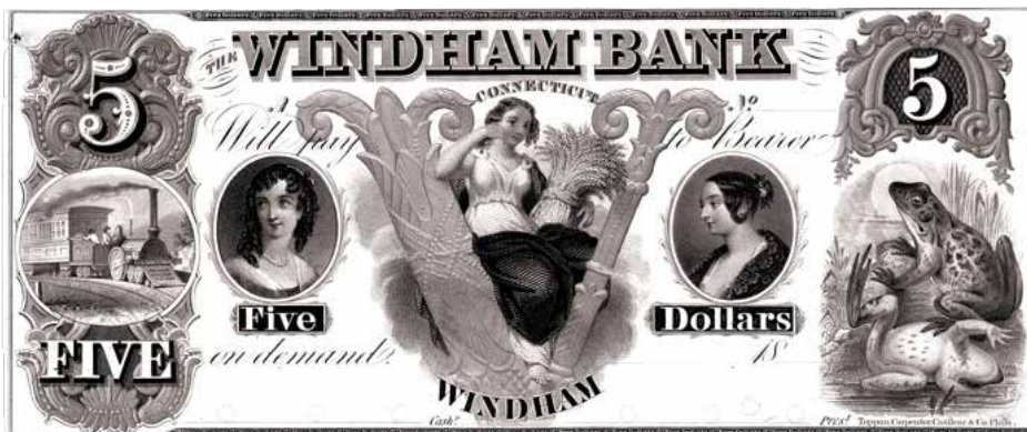
$5 private bank note, 1850s

In 1754, at the time of the French and Indian War, the legend says that two Windham men were returning home through the woods late one night when they were startled by strange and terrifying noises echoing through the night air.