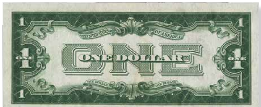
$1 silver certificate, series 1928

As you can see from the image at right, the first small sized dollar bills issued in America did not feature the Great Seal or much of any symbolism at all. Today, paper money collectors refer to currency with this design as “funny backs.”