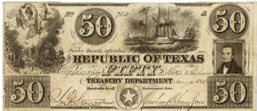
$50 note issued by Republic of Texas, pre-1845

There was more than one independent nation in America issuing bank notes in the period between the Revolutionary War and the Civil War. The Republic of Texas declared its independence from Mexico in 1836 and remained an independent nation until 1845, issuing its own paper money.